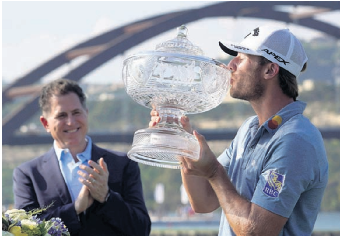
Sam Burns, right, kisses his trophy after defeating Cameron Young in the final match at the Dell Technologies Match Play Championship golf tournament in Austin, Texas, Sunday, March 26, 2023. Michael Dell, left, presented the trophy.

Cameron Young grew up around golf as the son of Sleepy Hollow's head pro, and while he's only 25, he still remembers Tiger Woods winning most of them. Fair